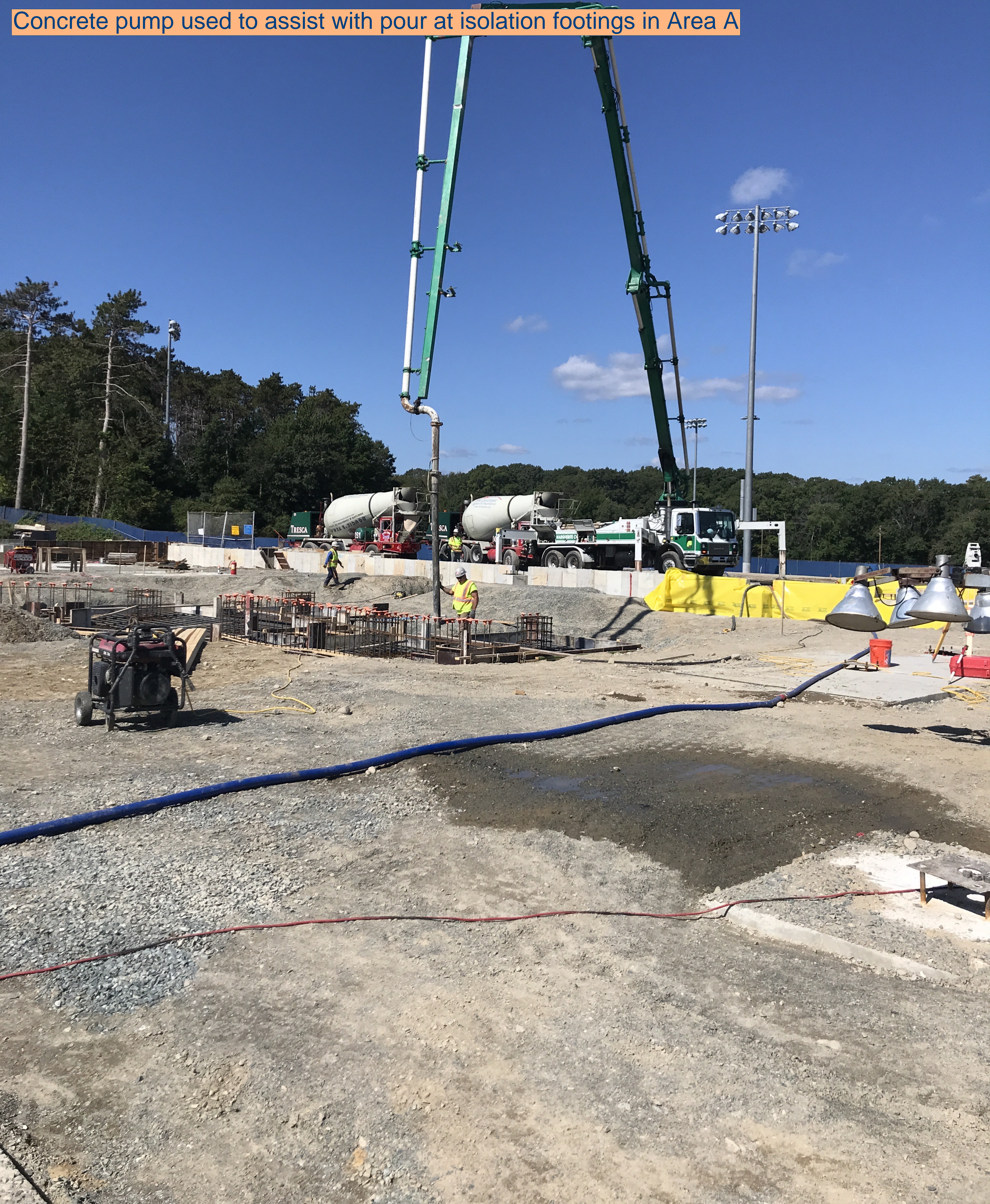
Concrete pump used to assist with pour at isolation footings in Area A