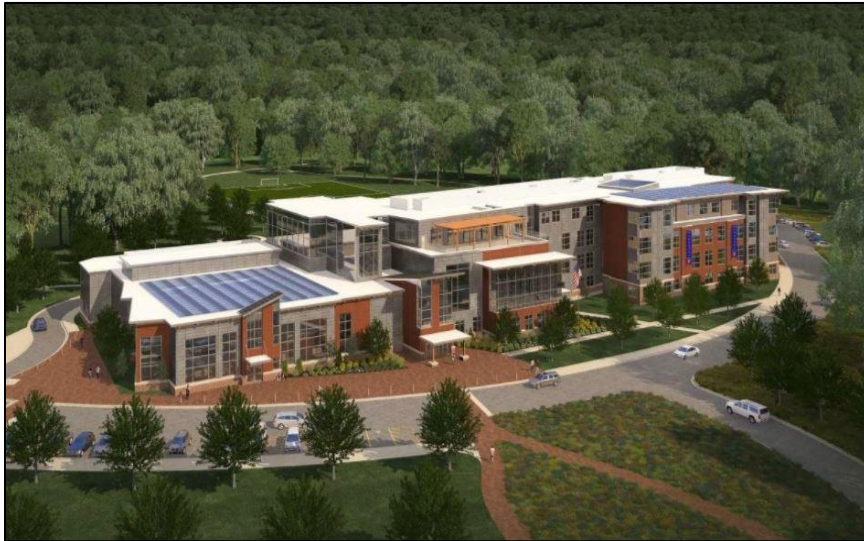
Kennedy Middle School – Natick, MA