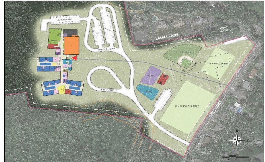
Hanlon Elementary School – Westwood, MA